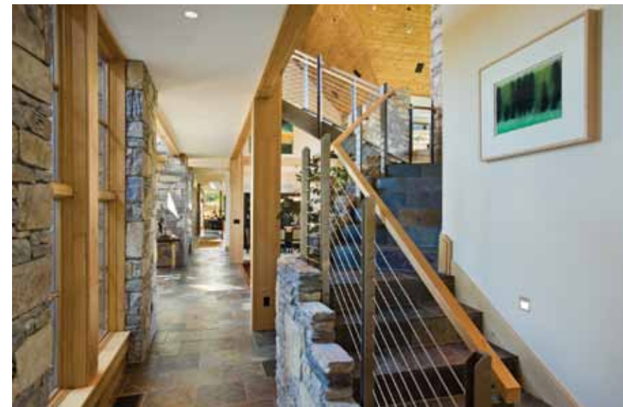
Top left: A stepped-platform design sets the formal dining area apart while preserving the sense of open space.