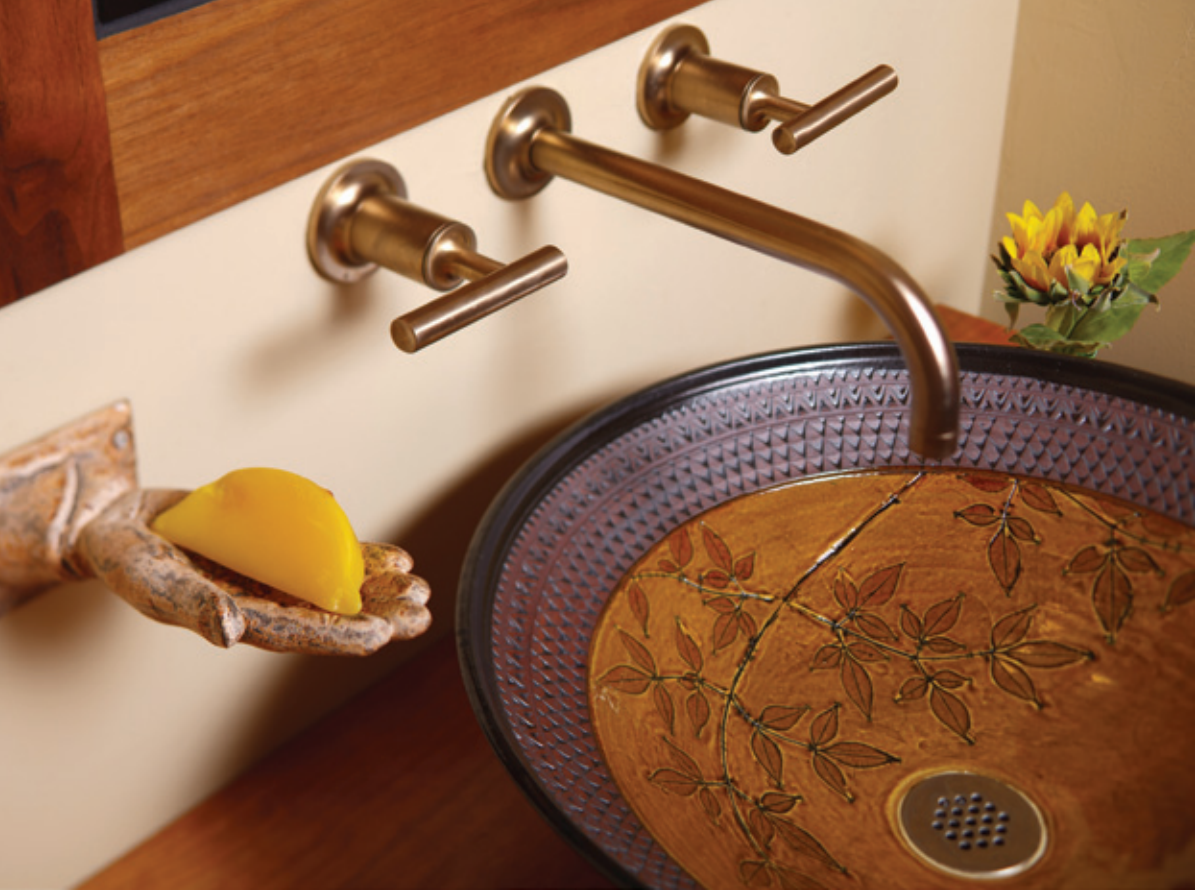
The Suzanne Crane basin finds good company with this graceful vanity's whimsical antiques.