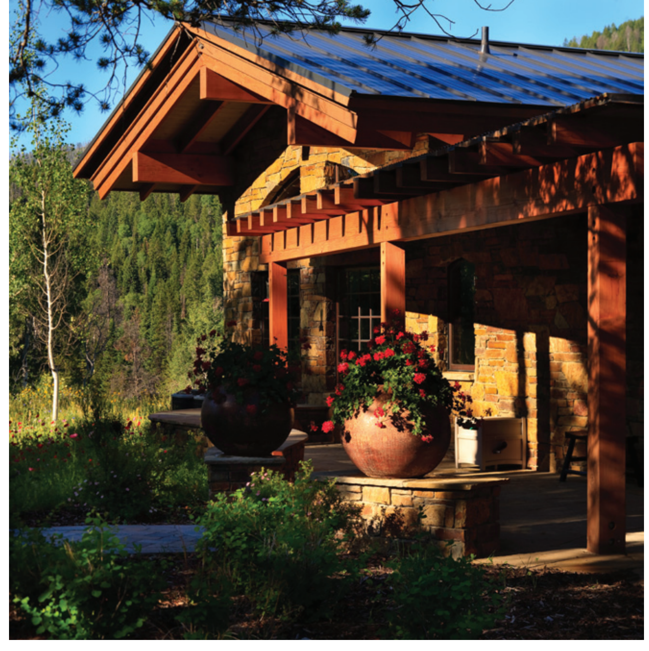
Pocket Ranch builds rapport from every dimension of its design on a rare, unforested lot off of Fall Creek Road in Wilson. It overlooks a quaint valley and sweeping expanses of the Teton Range to the north, with an arresting view of Glory Bowl to the west.

Within this space, Laurie Waterhouse of Laurie Waterhouse Interiors, knew she had to make the most, and with a single piece of furniture she saw the opportunity to further honor the outdoors through interior design. The sociable, double-sided couch anchors the room while fitting Spencer's own masculine aesthetics. Waterhouse describes it as "a brute," yet adds that it's as soft as Italian leather gloves.