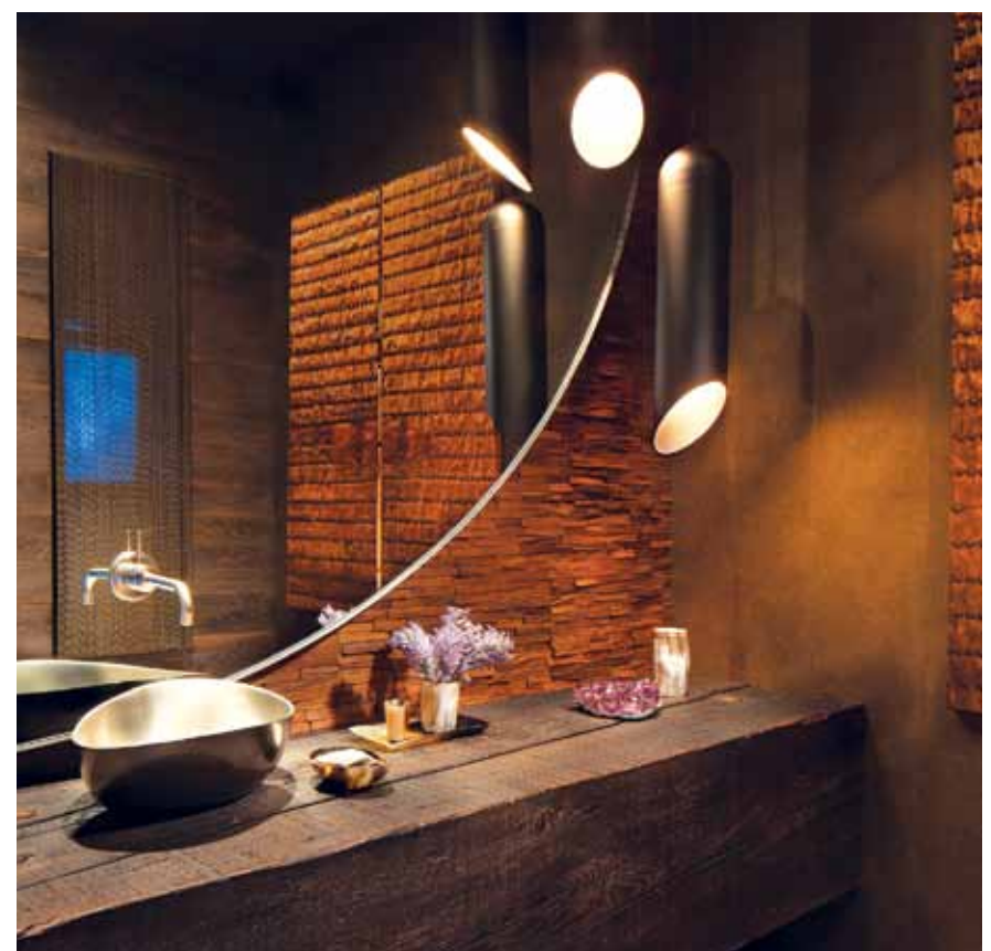
ABOVE, TOP: The home's jutting volumes are designed to maximize the views. ABOVE, BOTTOM: The counter surface in the powder room is crafted from a charred Douglas fir beam and the sculptural sink is custom cast bronze, with a planked reclaimed wood mosaic on the wall behind. RIGHT: A custom-patinaed Italian bronze pivot door marks the home's elegant entrance, with a slight step down to the level of the kitchen and living areas. The stairwell leading to the lower level is lit by a sensationally dramatic chandelier from Hudson Furniture in New York.